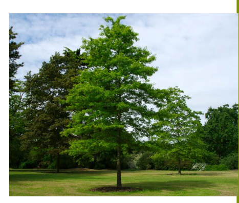
... to be replaced with pin oaks

underlying stormwater drains. These will be replaced with a row of pin oaks.